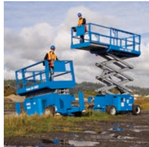
The GS-69 RT models feature a 1.52 m (5 ft) extension deck when equipped with outriggers.

The Genie GS™-4069 RT is the world's first 12.12 m (39 ft 9 in) full drive height rough terrain scissor lift in its class. The GS-2669 and the GS-3369 RT models are also equipped with this feature, providing ultimate end user 'up time' while on the jobsite.